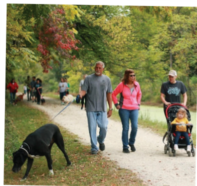
Direct Mail Processors team