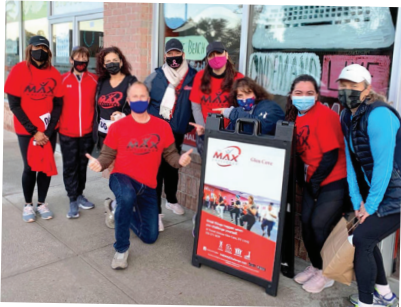
The MAX Challenge of Glen Cove out for their walk